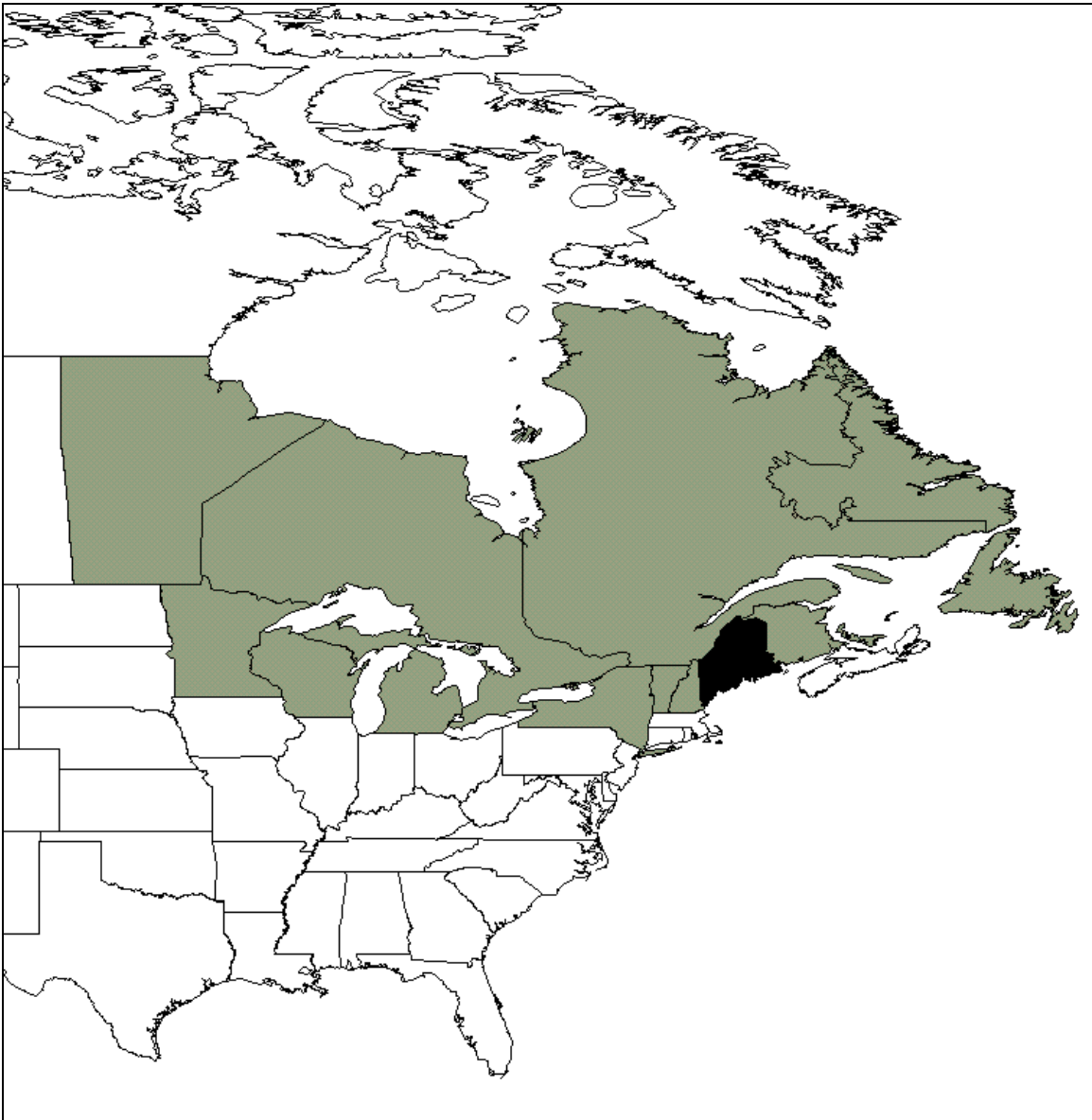
Figure 1. Occurrences of Listera auriculata in North America. States and provinces shaded in gray have at least one extant occurrence of the taxon. The state (Maine) shaded in black has five or more confirmed occurrences.